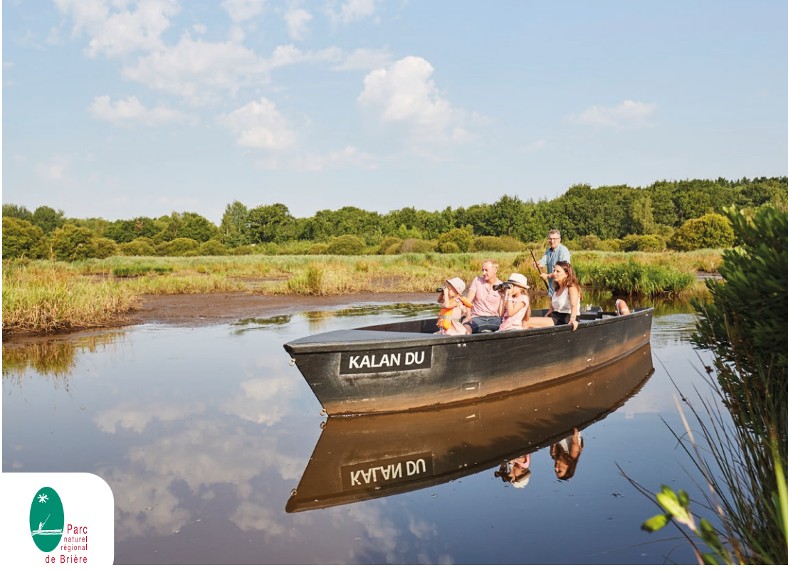
The traditional flat-bottomed boats, ideal for exploring the marshes!

Bring your walking boots, binoculars and... smartphone! The free app " Immersion en Brière " guides you along a 3km trail from Rozé Port near Saint-Malo-de-Guersac while interactive bollards detail the flora and fauna, history and traditions. A multimedia marshland!