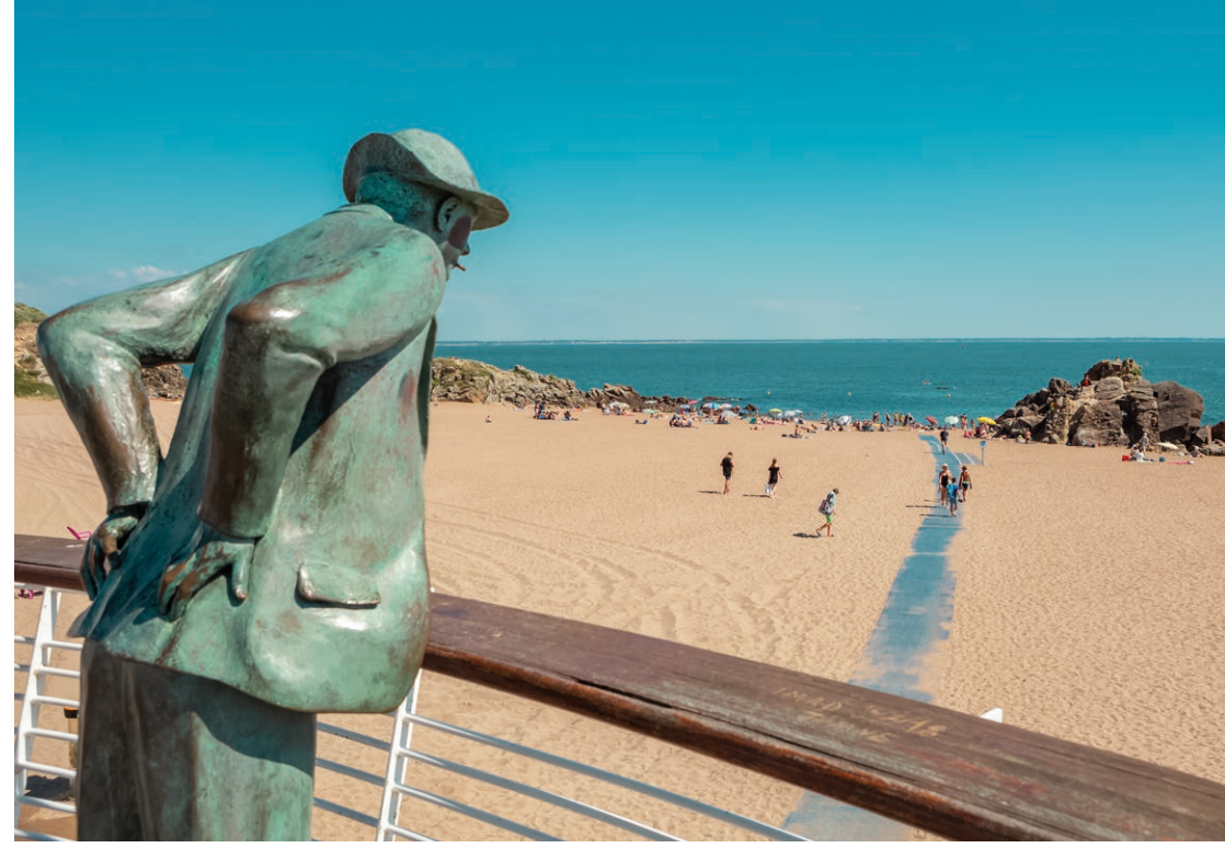
Join Mr Hulot in front of the beach

Today, we boast that the destination Saint-Nazaire has 20 beaches and coves, two designated Handiplage (with facilities for the handicapped), six provided with lifeguards in summer. Plus, three of our beaches have gained Blue Flag status.