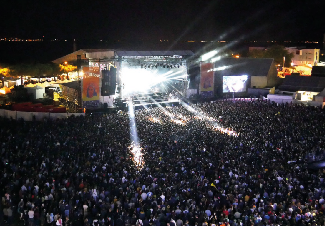
Near 45,000 people are enjoying the urban festival called Les Escales