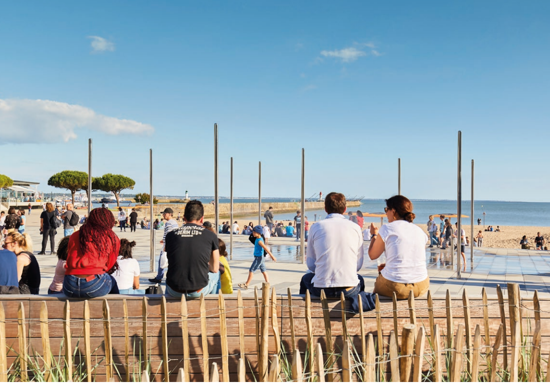
Place du Commando, the place to be!