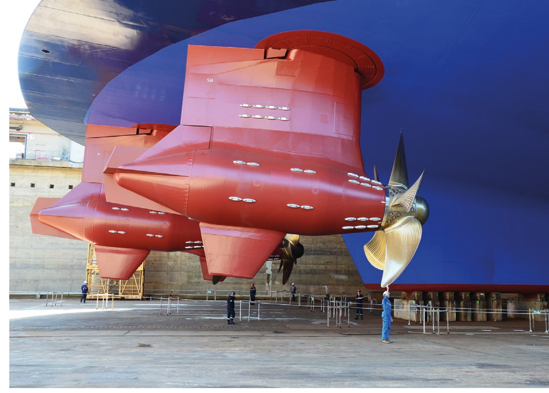
Look at the scale difference between the pod and the worker on the right of the picture!

Here in Saint-Nazaire, a ship's departure leaves no one indifferent. The whole city is shaped by the rhythm of the shipyard. France, Queen Mary 2, Harmony of the seas... Each of the legendary vessels built by Chantiers de l'Atlantique represents the excellence of the local know-how and is the pride of residents. So yes, when the fog horn sounds, the entire city quivers!